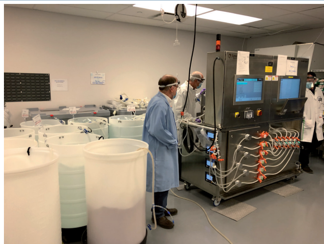
➤ Figure 3. The SkillPak PRO columns installed for the scaled-up MCC process.